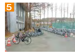
5 DO NOT park bicycles in front of the gymnasium entrance, as it hinders access to the building.