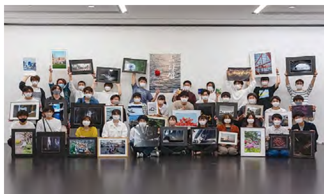
▲A sample of the Photography Club's skill!

Photography lets you preserve your precious years of university life as pictures, or share your perspective of the world with others. There are various ways to enjoy it. The next photo exhibition will be at the end of October. Please come and catch a glimpse of our vision of the world.