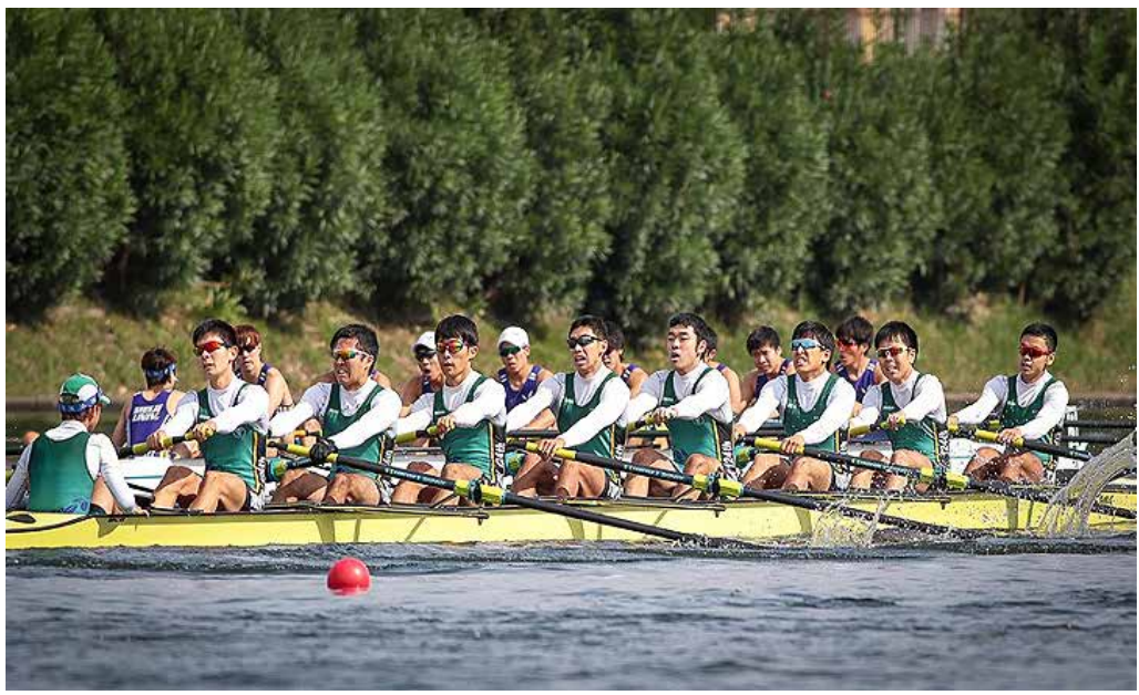
Boat race (eight)