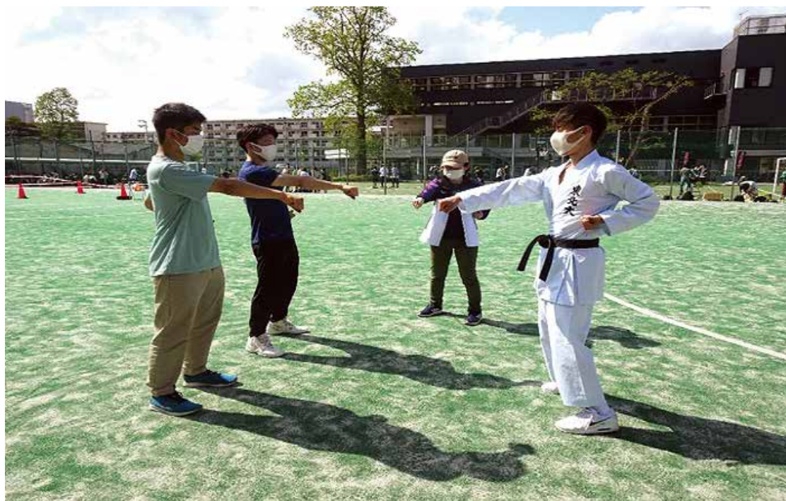
Spring Festival 2022

New students were finally able to meet in-person with student organizations that they had only had online interactions with before. The event deepened ties between new and returning students.