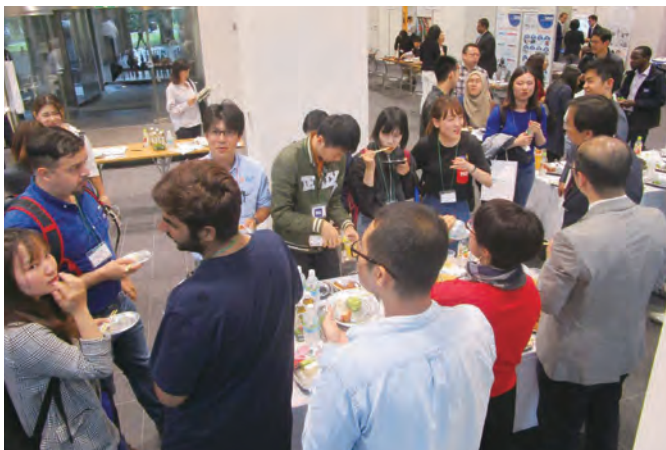
JETRO/Exchange event for international students and foreign-investment companies (2019)

The curriculum mainly comprises classes from the Tohoku University Japanese Language Program at Kawauchi and General Education curricula. It helps students to acquire the Japanese communication skills and understanding of corporate culture required to work in Japan. In consultation with the instructors, students can determine a course schedule that does not conflict with their research and meets their needs. In addition, the extracurricular seminars enable students to prepare for job-hunting activities in an organized manner. Please join DATEntre and turn your dreams of working in Japan into a reality! Participation on an as-needed basis is also possible. Please inquire if you are interested.