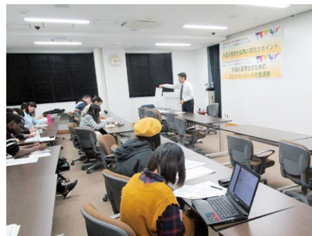
Entry Sheet Preparation